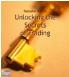
6 Cd Series - R200