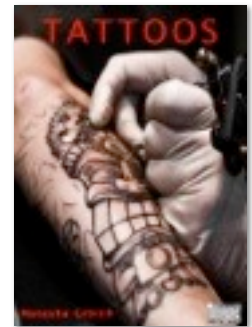
CD - R45 DVD - R80