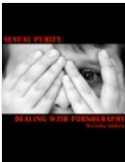
Double CD - R65 DVD - R80