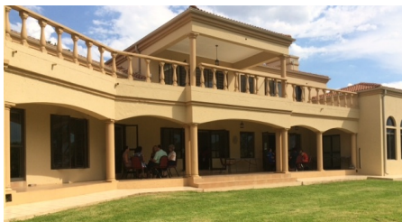
Leaders gathering at AGIHOS House