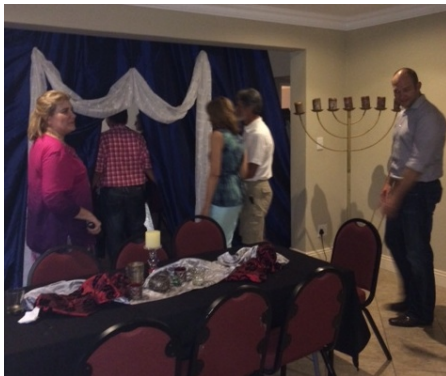
Going through the Door of Hope