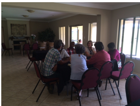
Times of prayer