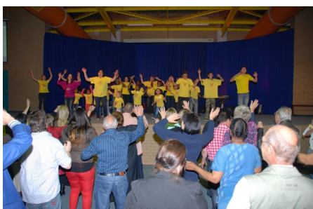
Praise time with the Little Lions!