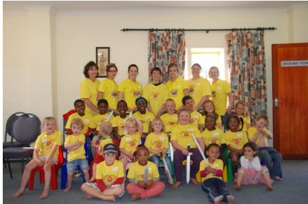
Our First Little Lions Delegates

The Summit was held in the ten Days of Awe as we entered the year 5774.